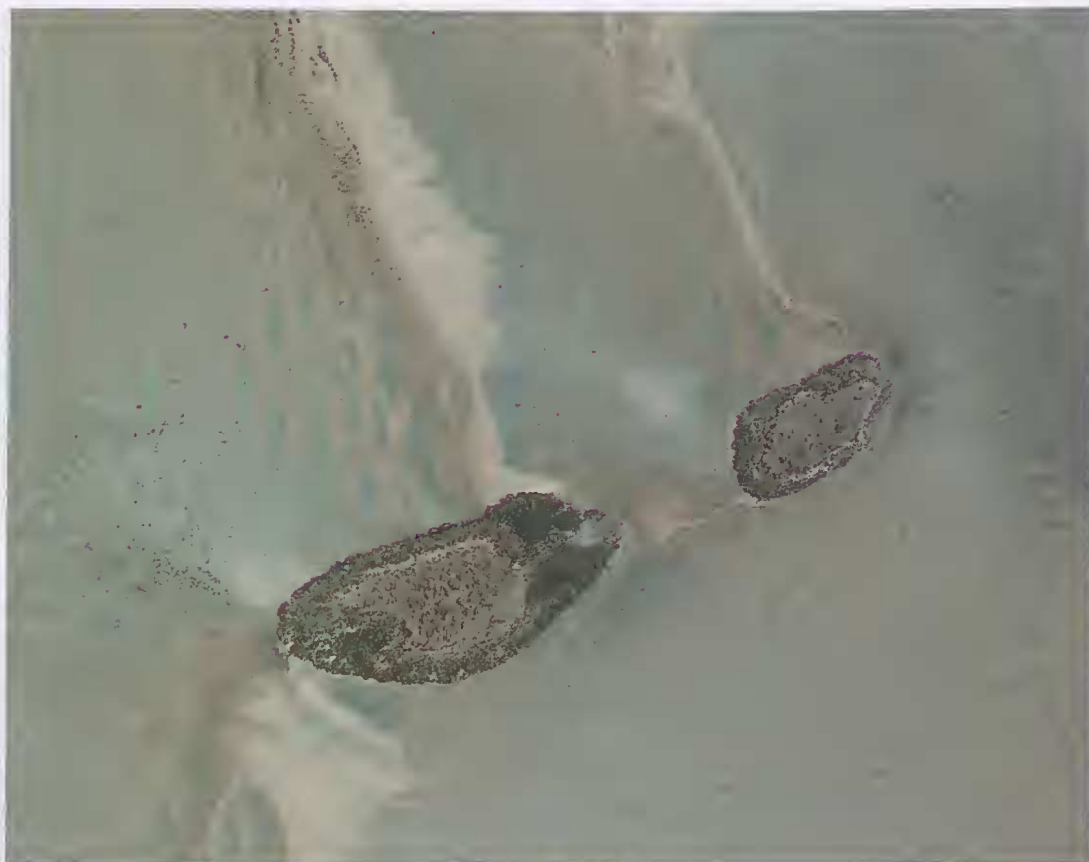
Figure 3. The Egret Islands on the edge of the high platform on the south-eastern margin of Montgomery Reef. Note the double containment banks of the high platform margin above the lower platform, with sand fans along their downside margin, and the crescent-shaped pools formed by coalescing ridges of rhodoliths and coral rubble in the lagoon.